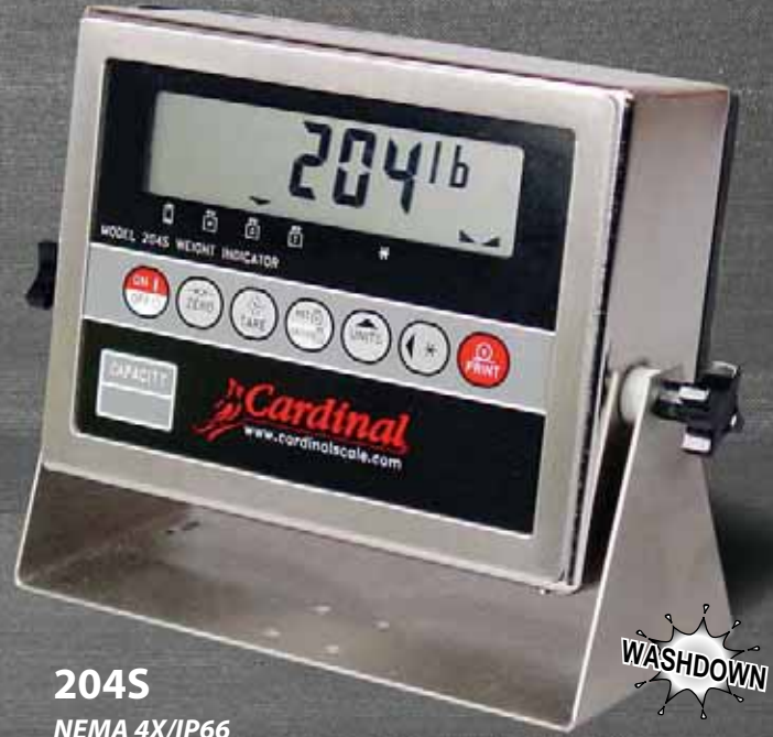
204S NEMA 4X/IP66 Washdown Stainless Steel