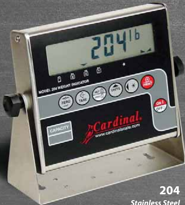
204 Stainless Steel