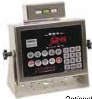
Optional Checkweigher Light Bar for Model 210